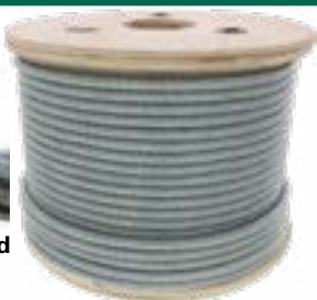
7x19 Galvanized Aircraft Cable

Preformed 7x19 Galvanized Aircraft Cable is the preferred construction when high strength, and flexibility are needed.