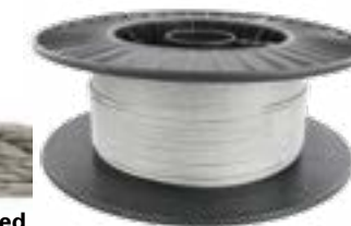
7x7 Galvanized Aircraft Cable

Preformed 7x7 Galvanized Aircraft Cable is the most commonly used, cost effective cable. Can be used in place of 7x19 cable where less flexibility is needed.